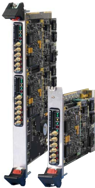
Model 74851 Model 73851