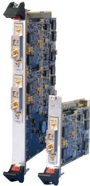
Model 74640 Model 73640