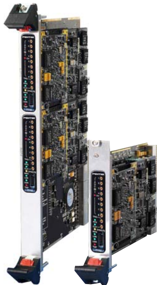
Model 74132 Model 73132