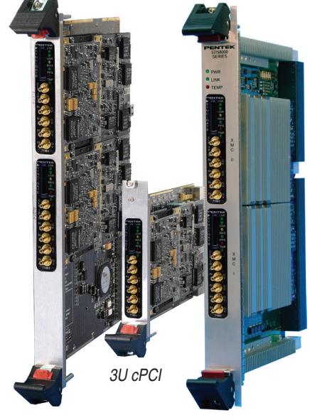
6U cPCI Double Density