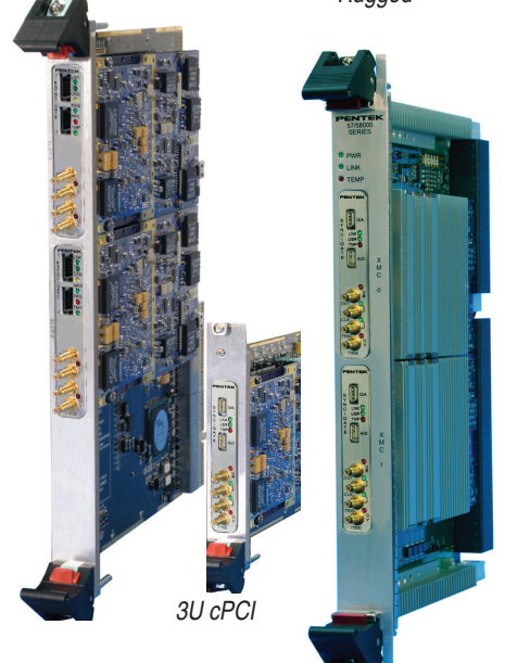
6U cPCI Double Density