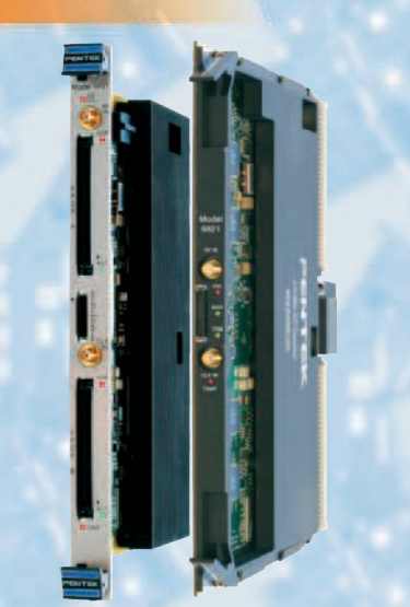
Model 6821 Commercial (left) and Conduction-cooled Version