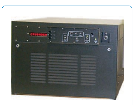
Ruggedized System Enclosure Protects the Commercial System Boards Shown Above