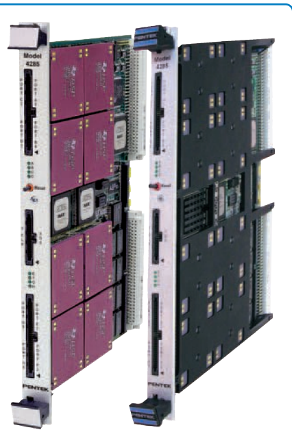
Model 4285 Commercial (left) and Ruggedized Version

Additional structures may include an aluminum plate attached to the top (or bottom) surface of the assembly with milled recesses so it conforms to the top surfaces of the heat-generating components. Heat is transferred from the devices through the aluminum plate to the edges of the board where it is clamped to a channel in the cold wall plate at each side of the chassis. Pentek's new 68xx Series of highspeed A/D converter boards with Virtex-II Pro FPGAs are now available in conduction-cooled versions.