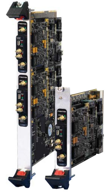
Model 74741 Model 73741

Option -104 provides 20 LVDS pairs between the FPGA and the J2 connector, Model 73741; J3 connector, Model 72741; J3 and J5 connectors, Model 74741.