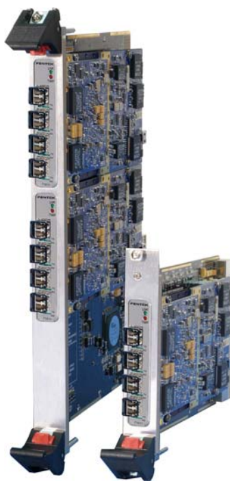
Model 74611 Model 73611