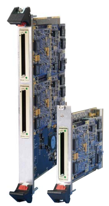
Model 74610 Model 73610