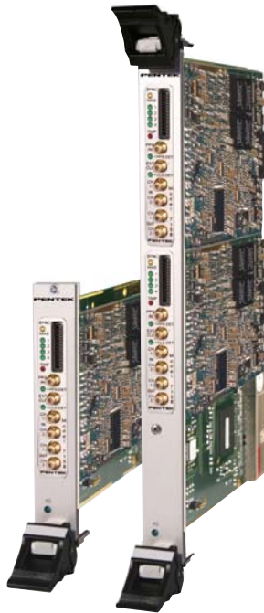
Model 7358 Model 7258D