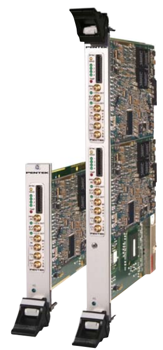
Model 7356 Model 7256D