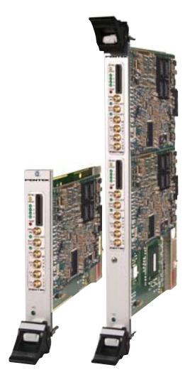
Model 7353 Model 7253D