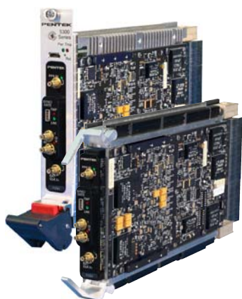
Model 53841 COTS (left) and rugged version