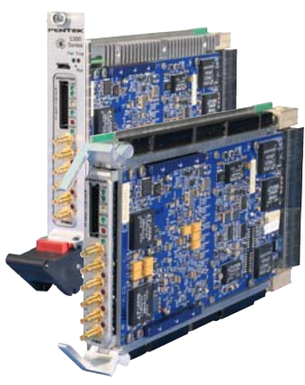
Model 53663 Commercial (left) and rugged version