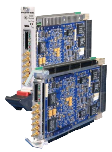
Model 53651 COTS (left) and rugged version