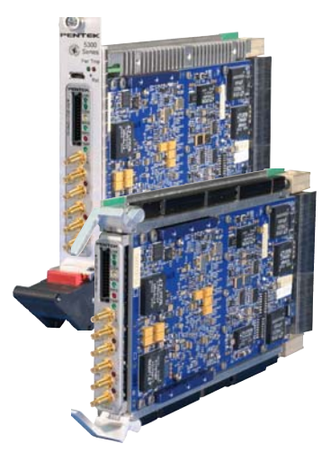
Model 53650 COTS (left) and rugged version