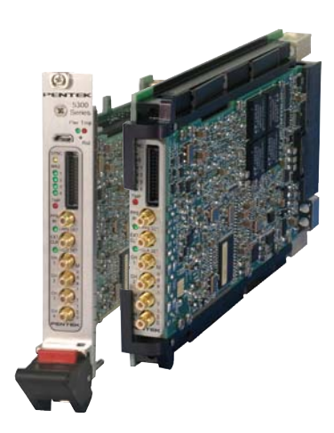
Model 5350 commercial (left) and conduction-cooled version