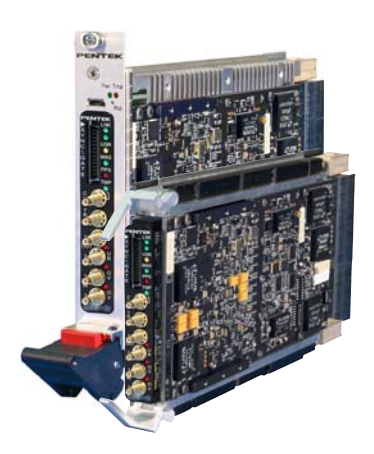
Model 52851 Commercial (left) and rugged version