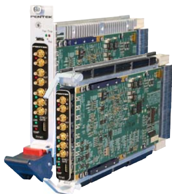
Model 52141CORS (left) and Rugged versions