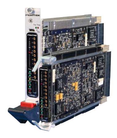
Model 52131 COTS (left) and rugged version