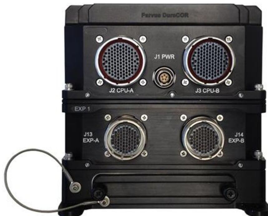
Curtiss-Wright Defense Solutions offers its DuraCOR 80-41 Intel Core i7 mission computer.

Kontron engineers customized the company's COTS Cobalt 901 to match Hughes DISD's SATCOM system requirements. Kontron's sealed and validated IP67 embedded computer system offered Hughes engineers a wide selection of processor, storage, power, and interface options, as well as a small terminal footprint optimized for performance, harsh environments, and reduced SWaP - top priorities for Hughes to meet end user requirements.