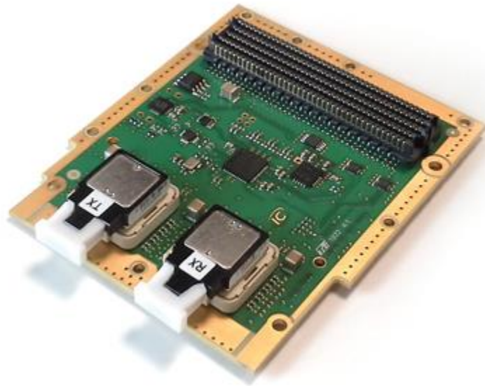
Interface Concept IC-OPT-FMCPa board