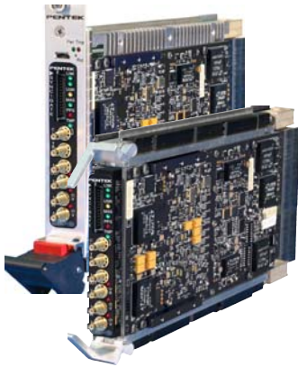
Model 52751 commercial (left) and rugged version