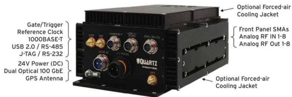
Figure 1. Example of RFSoc-base SFF Ruggedized Sub-System. Provides 8-channels of remote data acquisition and generation, local ARM processor system controller, FPGA fabric for DSP, and dual 100 GbE optical interfaces with VITA-49 data protocol.

Traditional military embedded systems often consist of sensors (e.g., antennas) mounted in locations to best capture signals (e.g., antenna masts) with coaxial cables carrying signals to and from the equipment bay. There, a common chassis often houses both the digital signal processors and the sensor interfaces, which require analog RF I/O circuitry and precision data converters to maintain the highest levels of signal fidelity and dynamic range.