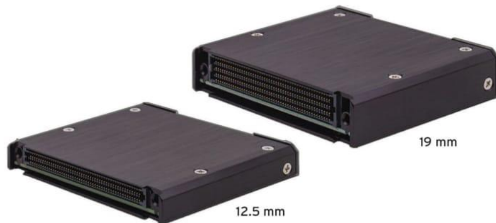
Figure 2. VITA 74 VNX SFF Modules, showing both the 12.5 mm and 19 mm widths with two and four rows of backplane contacts, respectively.

Over the last decade, well before SOSA came on the scene, many embedded system SFF proposals have been slowly moving through the standardization process at VITA. Now, SOSA is evaluating these architectures to determine if one or more of them can be adopted to support smaller SOSA systems.